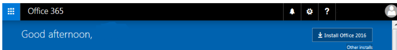
Fig 1: Screen example: